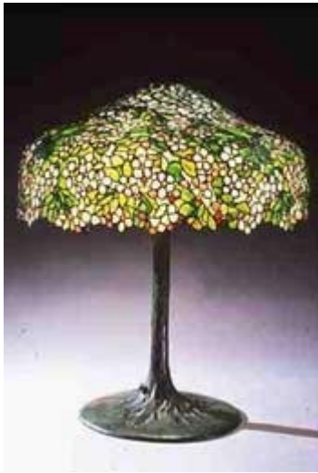
Apple Blossom Table Lamp, c. 1900-1910 Leaded glass, patinated bronze, H. 29", Diam. 25"

Look carefully at the lamps shown here. How many natural forms can you find and identify?