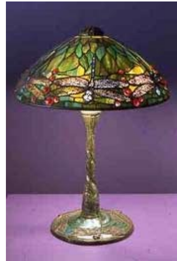
Miniature Mosaic Dragonfly Table Lamp, c. 1900-1910 Leaded glass, cabochon glass jewels, metal filigree, mosaic insets, patinated bronze, H. 19", Diam. 14"