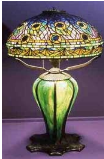
Blue Peacock Table Lamp, c. 1900-1910 Leaded glass, patinated bronze, H. 21 ", Diam. 12"